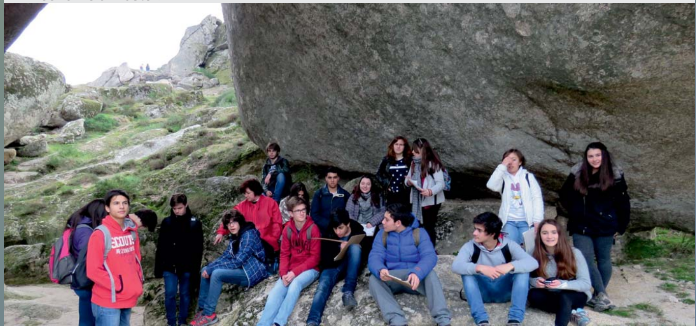
20 February – Educational program among the Fossils of Penha Garcia and the Boulders of Monsanto.

The musical animation was guaranteed by traditional groups from the parish and a diversified variety of invited guests. The event, which takes place next to the Olive Oil Museological Centre, counted yet with the attendance of dozens of regional products exhibitors, small inns, child animation, burlesque parades, themed workshops, live cooking, traditional blood sausage production demonstrations and the 7th MTB Ride "Olive Oil Route".